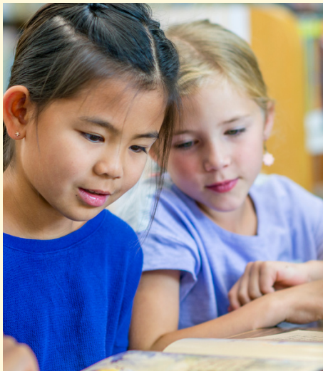
Allow your child to read alone, and read together! For those who need more of a push, model the behaviour you want to see..

Reading opens up doors to new worlds, inspires creativity, provides entertainment, boosts the imagination, opens doors and windows to an assortment of possibilities and best of all, has positive neurological and psychological benefits.