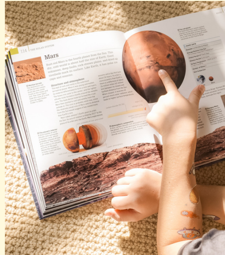
Ensure your child is exposed to both fiction and non fiction literature.

Whether you realize it or not, we read and rely on our ability to decode every single day. From text messages to signs, emails to business documents, and everything in between, it's hard to escape the need to read.